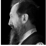
› Michele De Lucchi